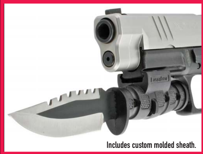
Includes custom molded sheath.

Weight: 2.6 oz. Blade Length: 2.75" Overall Length: 5.75" Handle: 30% Glass Filled Nylon Sheath: Custom Molded Polymer Blade: Medium Carbon Stainless